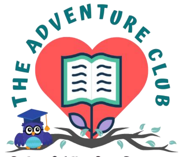
Before & After Care Program "Our family serving your family since 1989"